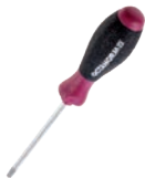
SCREWDRIVER HEX STAR T 30