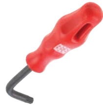
ANGLE SCREWDRIVER HEX STAR T 30