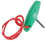
SCREWDRIVER HEX STAR T 30